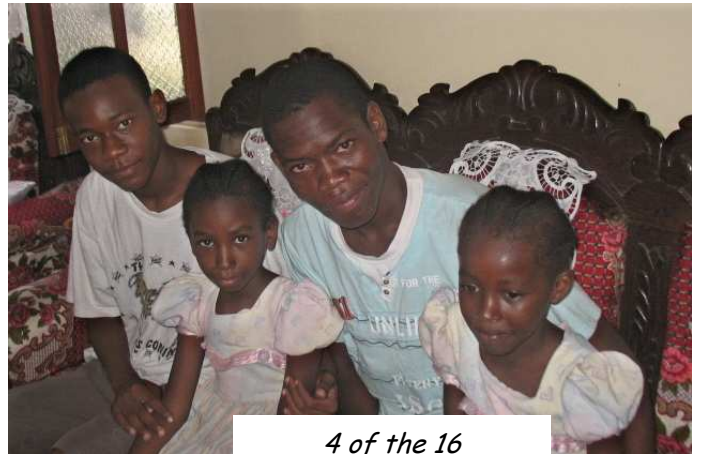
4 of the 16

her mother. However, she has been able to 'repay' that debt many times over because she and her husband are now responsible for housing and educating sixteen young people, both relatives and children of friends.